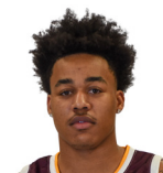
11 HARRISON Jr. ▶ Guard

MIN. 28.7 PPG 12.5 RPG 1.8 APG 2.4 FG% 38.6 3FG% 38.3